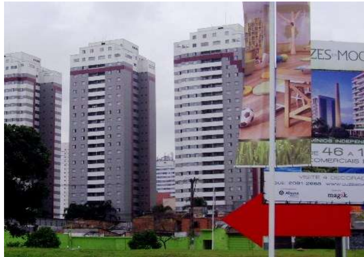
Image 5: The building ground for four future closed condominiums Luzes da Moóca in the eastern district Moóca. In the back the remains of irregular settlement, followed by already constructed vertical condominiums

Locating social housing in central areas is also part of the innovative urban plan and supposed to be realized by renovating and constructing central housing, rent subsidies, development of a cortiço policy, and the inclusion of ZEIS areas. Financed housing exists in the form of homeownership, the rental program Social Location (Locação Social), and the emergency subsidy Rental