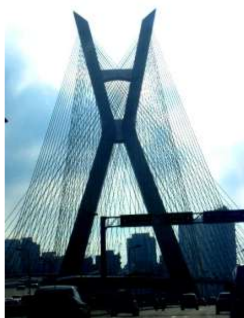
Image 6: The Bridge Octavio Frias de Oliveira

“There is much evidence to indicate that São Paulo is still in the early stages of implementing its social policy” (UN-HABITAT 2010: 87). The professor of architecture and urbanism in São Paulo, Erminia Maricato, stated that slum upgrading is ‘not sustainable’. Even though, infrastructure, housing, and education possibilities have been meliorated, the daily struggle for survival goes on (UN-HABITAT 2010: 121). While carrying out large eviction has become more difficult due to new laws, it still happens that favela or cortiço dwellers have to leave their homes,