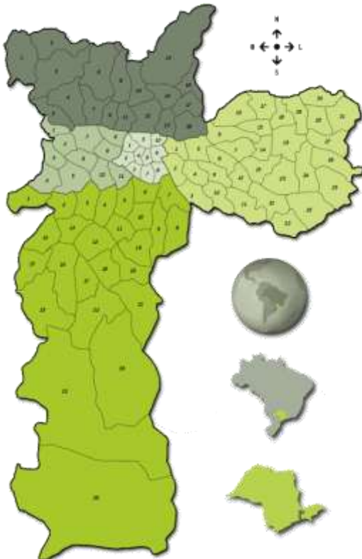
Image 2: The municipality of São Paulo (left); Brazil in the Latin American continent (top right); Brazil and the southeast location of the state of São Paulo (mid right); São Paulo's location within the state of São Paulo (bottom right).

Caldeira's 'Cidade de Muros' (2000; city of walls) analyzes the urban segregation process of São Paulo from a rather sociological and psychological perspective, primarily during the period from 1950 until the end of the 1990s. The circle of violence, demographic changes, the economic crisis, and the impoverishment of lower classes contribute to the segregation development. Referring to her, middle and high classes have the desire to control and dominate lower classes, as well as they feel the need for homogenization. Amongst others, the language of crime supports the development of inequalities, expressed in urban space: