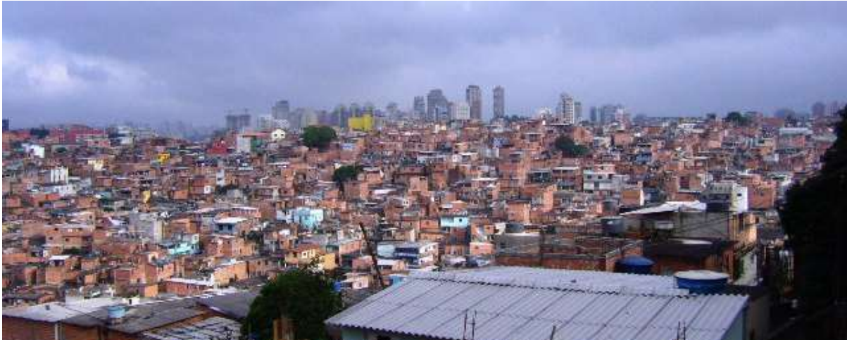
Image 3: The Paraisópolis ‘danger zone’ with the skyscrapers of Morumbi ‘fear zone’ in the background